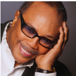
QUINCY JONES A STORIED LIFE AND CAREER FEBRUARY 4, 2012

Considered one of the most significant figures in American popular music, Quincy Jones' career has encompassed the roles of composer, record producer, artist, film producer, arranger, conductor, instrumentalist, television producer, record company executive, magazine founder and multi-media entrepreneur. His creative magic has spanned over six decades and he has worked with such legendary names as Billie Holiday, Frank Sinatra, Count Basie, Ella Fitzgerald, Ray Charles, Michael Jackson and hundreds more. In a Richmond Forum first, "Q" will share the amazing stories of his life and career.