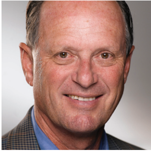
ROBERT BALLARD THE LAST GREAT FRONTIER NOVEMBER 12, 2011

Best known for his 1985 discovery of the Titanic shipwreck, Robert Ballard is a veteran of more than 125 expeditions, many in search of lost ships and ancient artifacts. He is president of the Institute for Exploration in Mystic, Connecticut, and director of the Institute for Archaeological Oceanography at the University of Rhode Island. Ballard will share his passion and discoveries in the last great uncharted frontier, where he uses cutting-edge science and technology to explore the ocean's depths in order to better understand and preserve our waters for the generations that follow.