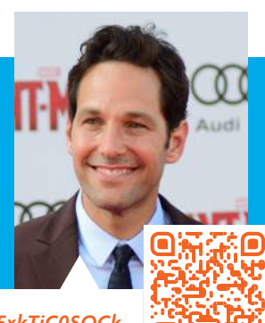
Watch Paul Rudd's final round performance: <a href="https://www.youtube.com/watch?v=ExkTjC0SQCk">www.youtube.com/watch?v=ExkTjC0SQCk</a>